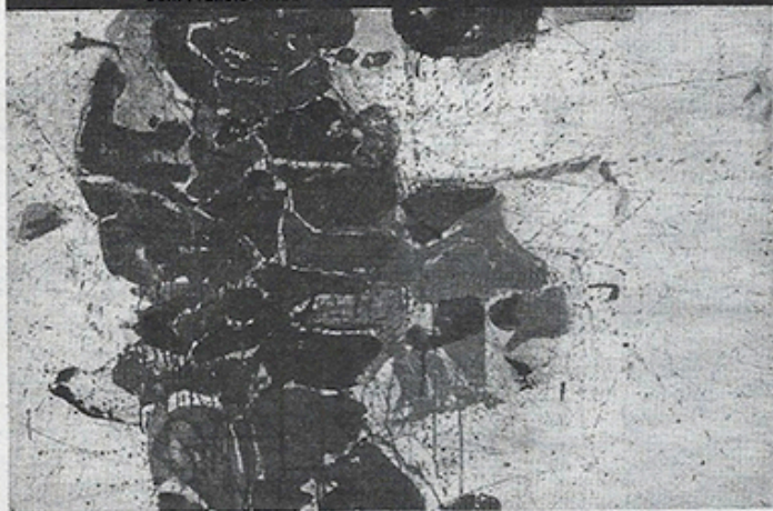
Sam Francis, Middle Blue #5 , 1959-60, watercolor on paper

collaborations seeking solutions to ecological challenges.